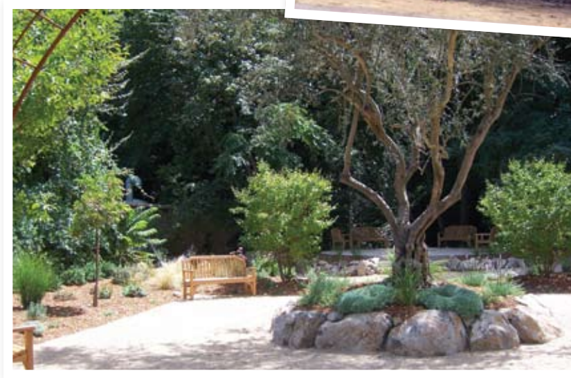
Forgiveness Garden Finished!

“Never underestimate the power of a few committed people to change the world. Indeed, it is the only thing that ever has.”