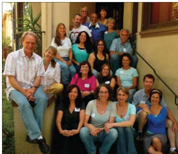
Process graduates smile for the camera at a recent East Bay gathering.