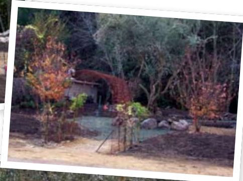
A work in progress